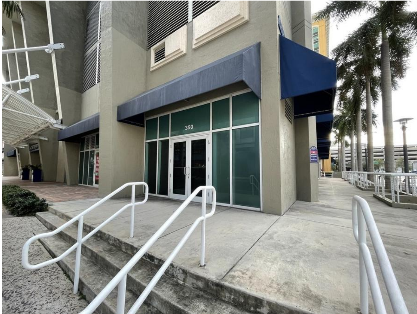
North Facing Patio Space

350 SE Second St, Fort Lauderdale, FL 33301